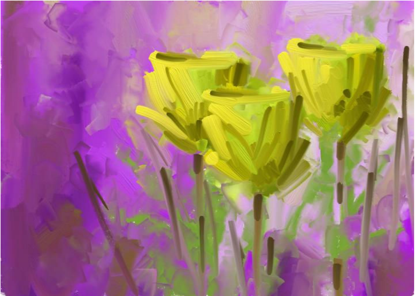
Step 7: More strokes added