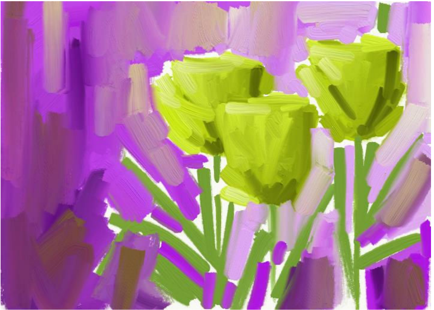
Step 4: More Strokes plus more color added